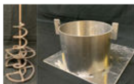
Broom & Squeegee Bundle 850 Auger & Bucket Holder