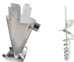
2 Part Resin Mixer