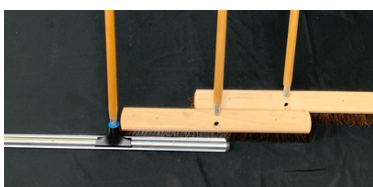
Broom & Squeegee Bundle