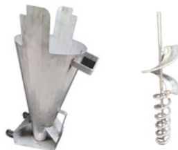
2 Part Resin Mixer