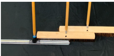
Broom & Squeegee Bundle